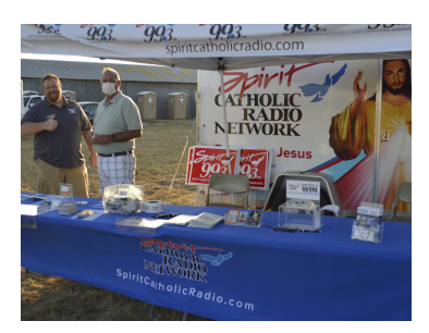
Encounter Jesus! spiritcatholicradio.com